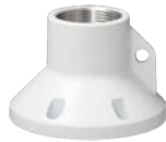
WV-QCL101-W Mount Bracket