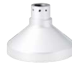
WV-QSR501-W Mount Bracket