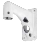
WV-QWL501-W Mount Bracket