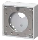
WV-QJB500-W Mount Bracket